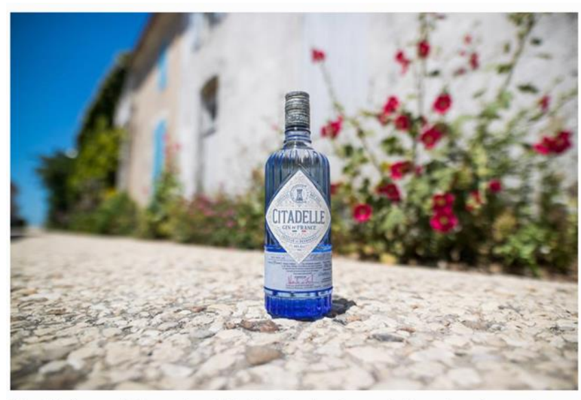
Citadelle is a craft gin produced like the finest cognacs - in France's cognac region.

Citadelle: France's most famous spirit is Cognac, and this gin is made by world renowned producer Ferrand Cognac. But because by law Cognac can only be distilled from September to April, they use the same small copper pot stills to create this "Chateau to bottle" gin using juniper berries grown on Ferrand's Chateau de Bonbonnet estate in Cognac, while the spirit is entirely distilled from French wheat. They add a whopping 18 other botanicals, from fennel to star anise, nutmeg to cinnamon and both orange and lemon peel. While many premium spirits use multiple distillations to create smoothness, Citadelle unusually does a single distillation to maximize flavors, and the result is a peppery, herbaceous gin perfect for G&Ts. When introduced in 2017 it won both Spirit of the Year and Double Gold at the prestigious World Spirits Awards, yet is very reasonably priced at $26, <u>available nationwide from Drizly.com</u>.